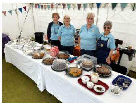
Ladies from Hunstanton & District Rotary did stalwart work in the Vintage Tea tent.