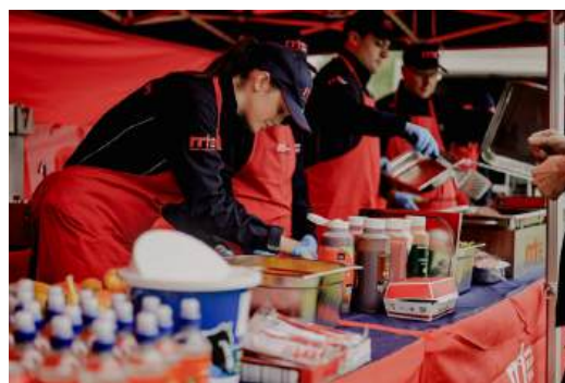
The RRT team had a busy day on the BBQ.